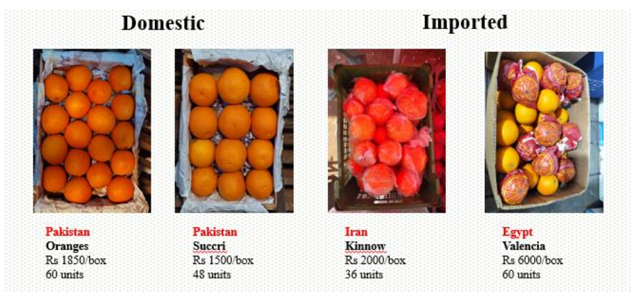
Figure 1: Pricing difference between the local and imported fruits.

The prices of local fruit varieties varied widely, indicating the influence of postharvest practices in addition to the diversity of produce as shown in figure 1 and 2. Fruit imports, particularly those from developed countries like France and New Zealand, showed a premium positioning in terms of price as shown in figure 3. The impact of superior postharvest handling on market value was highlighted by the significantly higher price of Granny Smith apples imported from France as opposed to local varieties.