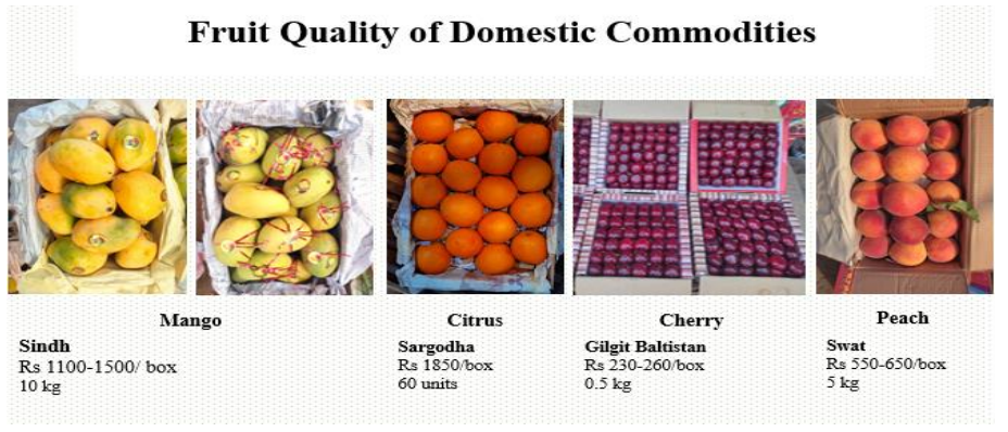
Figure 2: Quality and pricing of local commodities.