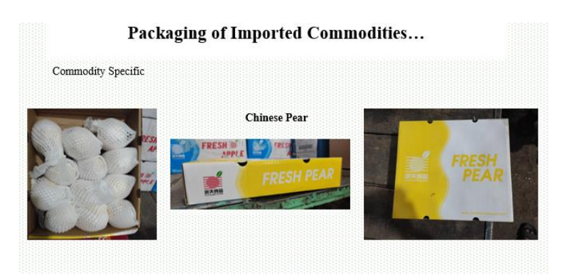
Figure 3: Packing and quality of imported fruits.

Fruit origin has been shown to have a significant impact on postharvest procedures. Fruit imports, particularly those from France and New Zealand, followed traceability guidelines and gave detailed information about the origin of the product such as shown in figure 4. On the other hand, traceability was frequently hampered by the lack of sufficient origin information for local fruits. This discrepancy made it clear that uniform traceability procedures were required in the neighborhood fruit market in order to increase openness and foster customer confidence.