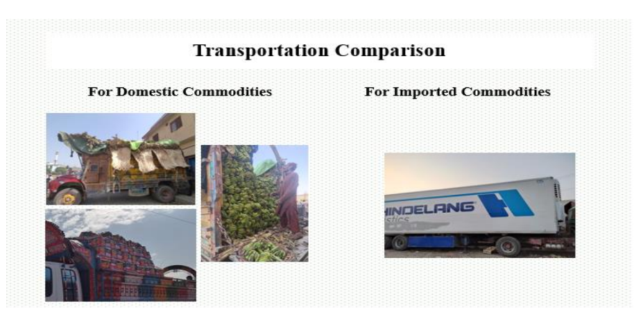
Figure 5: Transportation for both domestic and imported fruits.

reefer containers as shown in figure 5. This kind of transportation, which had cooling capabilities, was essential in keeping the imported fruits fresh during the trip. The correlation between improved postharvest outcomes and superior transportation practices was further highlighted by the observation of transportation excellence in imported fruits.